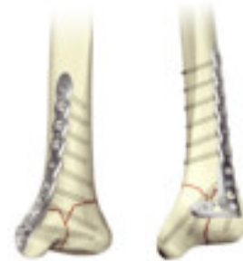
AxSOS Distal Tibia