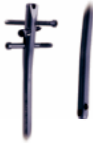
T2 Distal Tibia