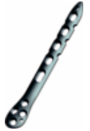
Distal Fibula Plate