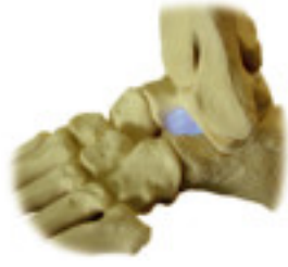
Flat Foot Device