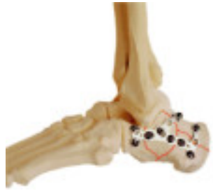
SPS Calcaneal Plate