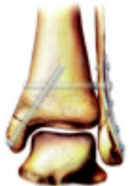
Inion Bioresorbable Implants