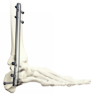
T2 Ankle Arthrodesis