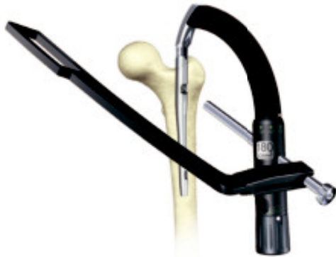
Gamma3™ Trochanteric Nail

Stryker is proud to work side-by-side with trauma and orthopaedic surgeons to herald in the future of orthopaedic fracture treatment.